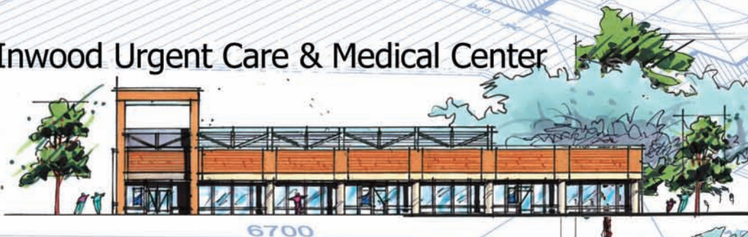
Inwood Urgent Care & Medical Center