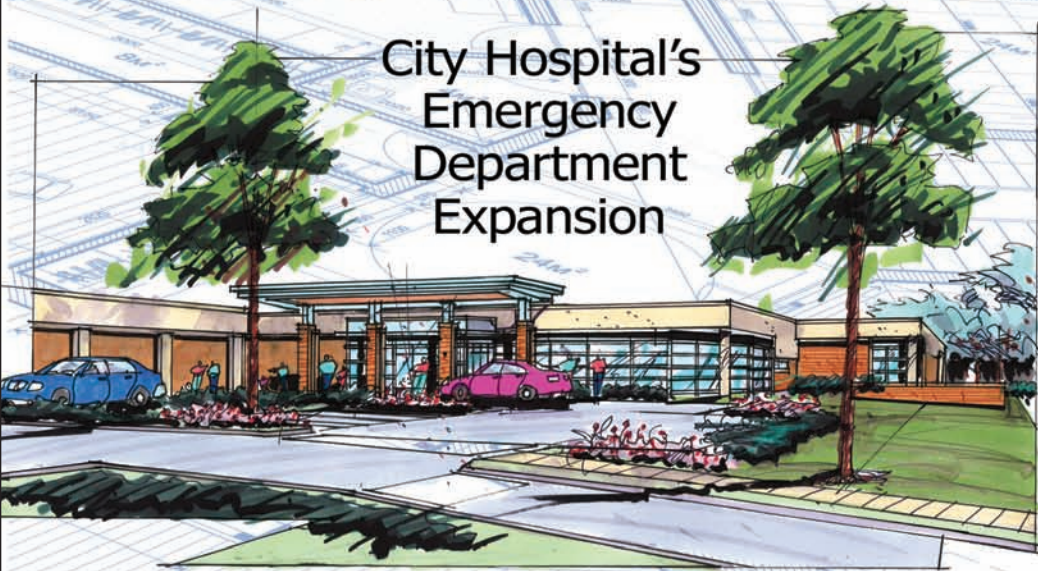
City Hospital's Emergency Department Expansion